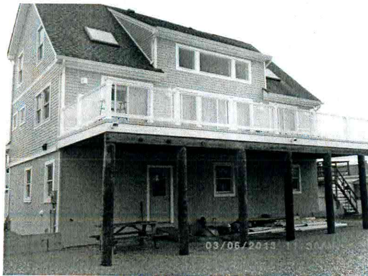
REAR VIEW – 03/06/2013