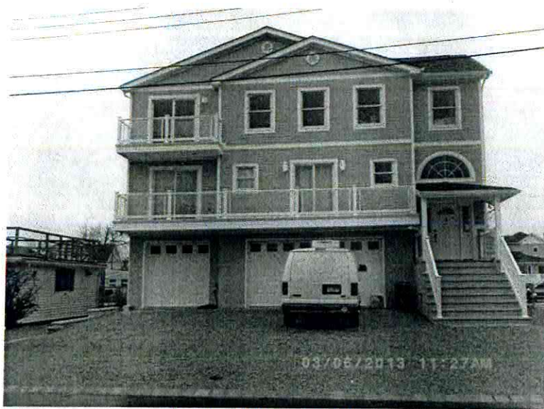
FRONT VIEW – 03/06/2013

If using the Elevation Certificate to obtain NFIP flood insurance, affix at least 2 building photographs below according to the instructions for Item A6. Identify all photographs with date taken; "Front View" and "Rear View"; and, if required, "Right Side View" and "Left Side View." When applicable, photographs must show the foundation with representative examples of the flood openings or vents, as indicated in Section A8. If submitting more photographs than will fit on this page, use the Continuation Page.