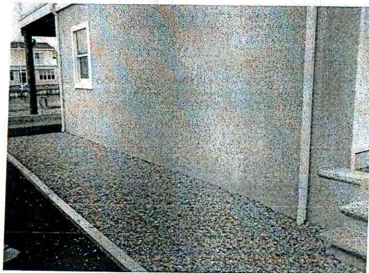
LEFT SIDE VIEW – 03/06/2013