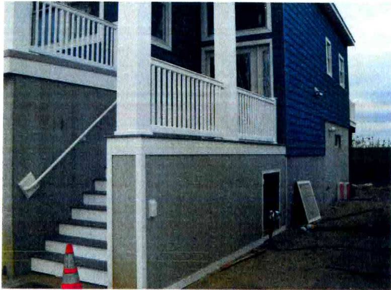
"Right Side View" 1/6/2010