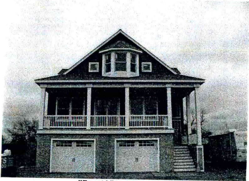
"Front View" 1/6/2010