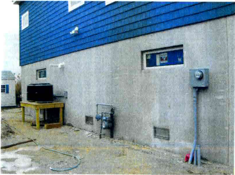
"Left Side View" 1/6/2010