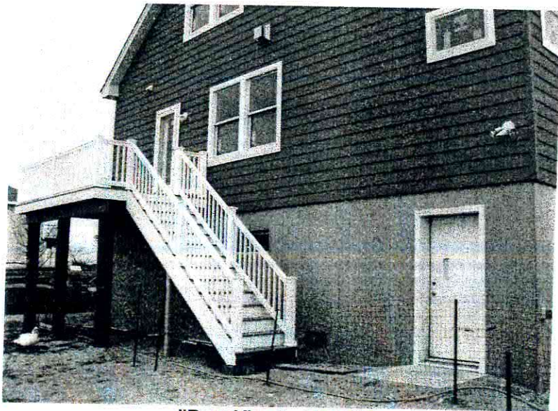
"Rear View" 1/6/2010