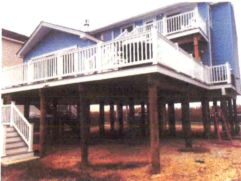
355 Bay Shore Drive, Rear 11/05/2014