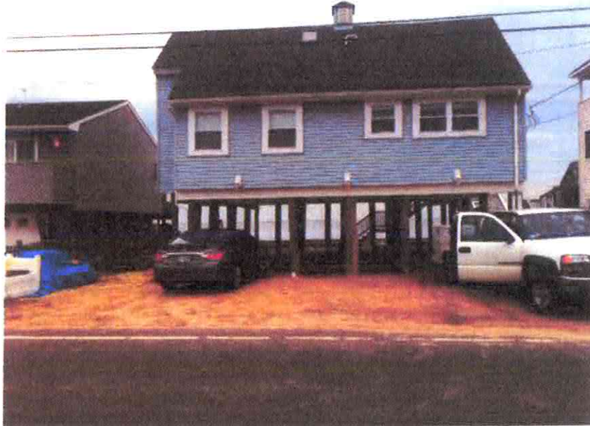
355 Bay Shore Drive, Front 11/05/2014

If using the Elevation Certificate to obtain NFIP flood insurance, affix at least 2 building photographs below according to the instructions for Item A6. Identify all photographs with date taken; "Front View" and "Rear View"; and, if required, "Right Side View" and "Left Side View." When applicable, photographs must show the foundation with representative examples of the flood openings or vents, as indicated in Section A8. If submitting more photographs than will fit on this page, use the Continuation Page.