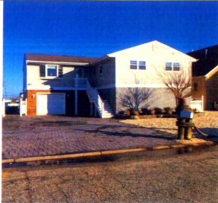
234 Montclair Road South, Front, 11/24/14

If using the Elevation Certificate to obtain NFIP flood insurance, affix at least 2 building photographs below according to the instructions for Item A6. Identify all photographs with date taken; "Front View" and "Rear View"; and, if required, "Right Side View" and "Left Side View." When applicable, photographs must show the foundation with representative examples of the flood openings or vents, as indicated in Section A8. If submitting more photographs than will fit on this page, use the Continuation Page.