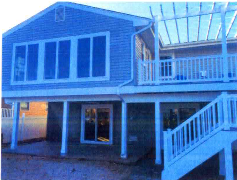
234 Montclair Road South, Rear, 11/24/14