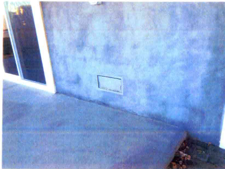
234 Montclair Road South, Vent, 11/24/14