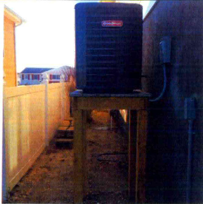
234 Montclair Road South, Utility, 11/24/14

If submitting more photographs than will fit on the preceding page, affix the additional photographs below. Identify all photographs with: date taken; "Front View" and "Rear View"; and, if required, "Right Side View" and "Left Side View." When applicable, photographs must show the foundation with representative examples of the flood openings or vents, as indicated in Section A8.