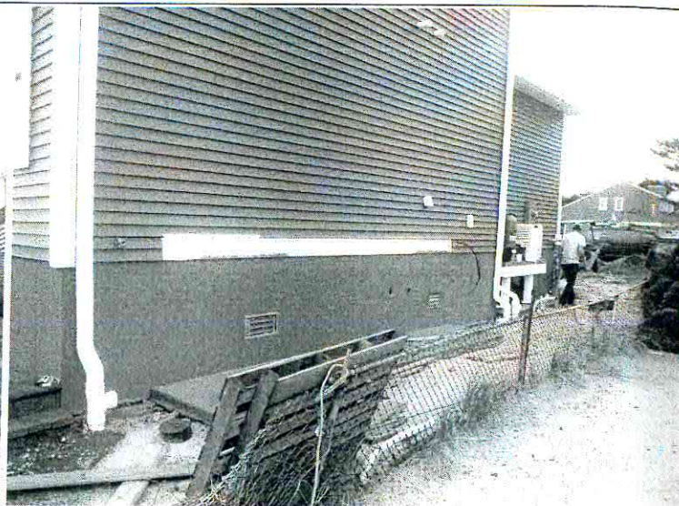
Left Side View (8-13-13)