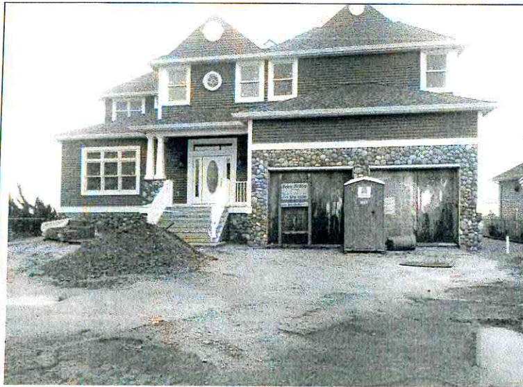
Front View (8-13-13)

If using the Elevation Certificate to obtain NFIP flood insurance, affix at least 2 building photographs below according to the instructions for Item A6. Identify all photographs with date taken; "Front View" and "Rear View"; and, if required, "Right Side View" and "Left Side View." When applicable, photographs must show the foundation with representative examples of the flood openings or vents, as indicated in Section A8. If submitting more photographs than will fit on this page, use the Continuation Page.