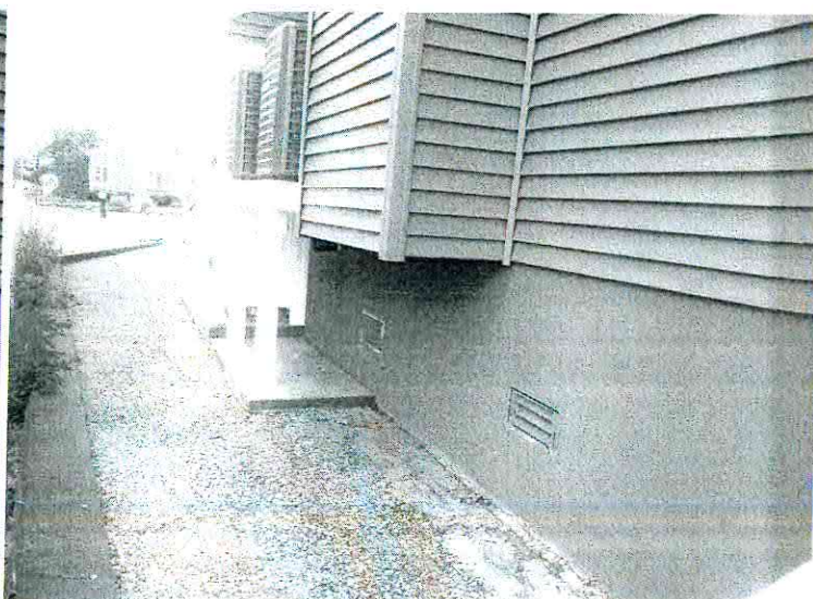
Right Side View (8-13-13)