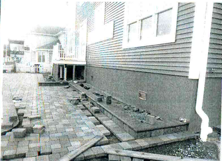
Rear View (8-13-13)