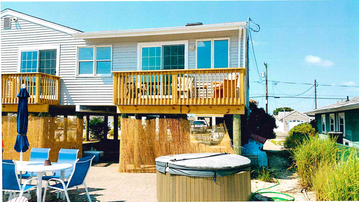
REAR VIEW LEFT

If submitting more photographs than will fit on the preceding page, affix the additional photographs below. Identify all photographs with: date taken; "Front View" and "Rear View"; and, if required, "Right Side View" and "Left Side View." When applicable, photographs must show the foundation with representative examples of the flood openings or vents, as indicated in Section A8.