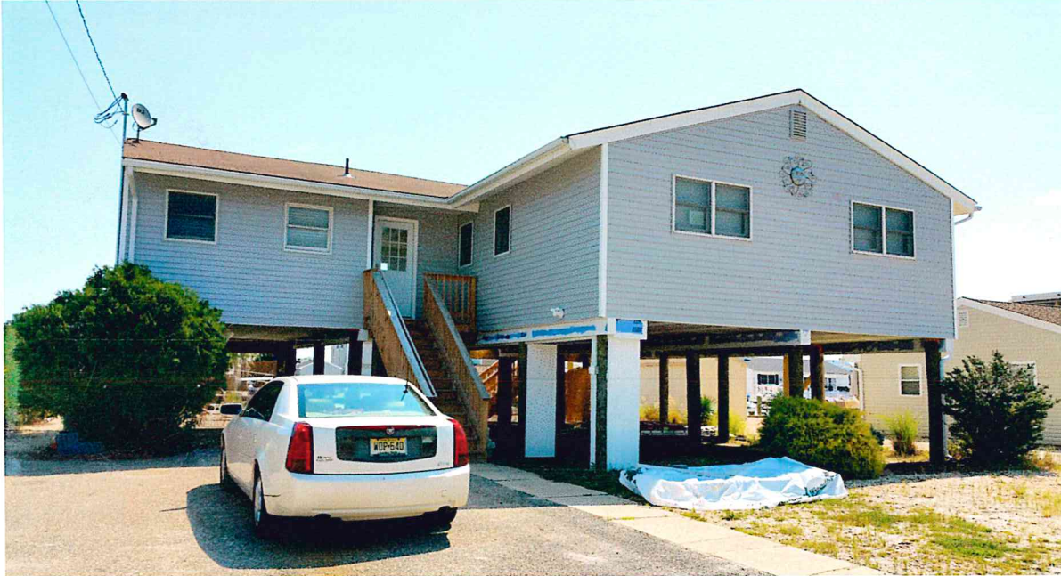
FRONT VIEW LEFT

If using the Elevation Certificate to obtain NFIP flood insurance, affix at least 2 building photographs below according to the instructions for Item A6. Identify all photographs with date taken; "Front View" and "Rear View"; and, if required, "Right Side View" and "Left Side View." When applicable, photographs must show the foundation with representative examples of the flood openings or vents, as indicated in Section A8. If submitting more photographs than will fit on this page, use the Continuation Page.