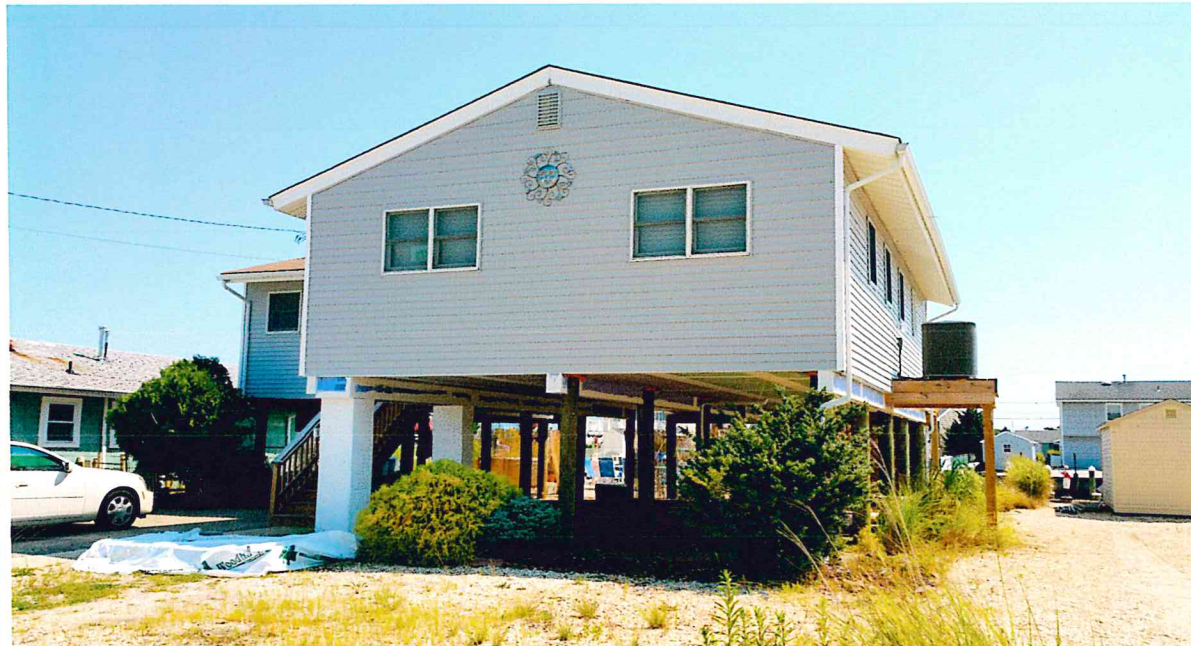
FRONT VIEW RIGHT