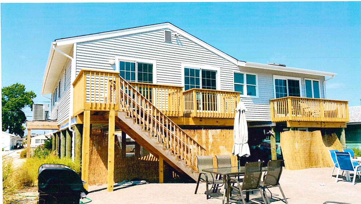
REAR VIEW RIGHT