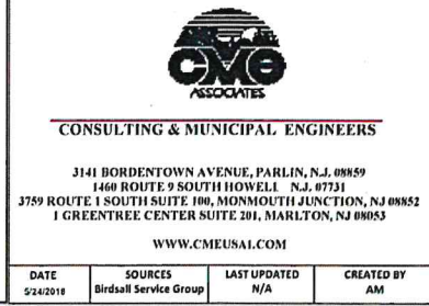
Sweet Jenny Redevelopment Area